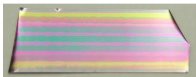
Figure 2. Photograph of inkjet printed \text{CeO}_2 filaments on a RABiTS substrate.

Optimisation of the Microfab drive waveform for the \text{CeO}_2 precursor ink resulted in a drop volume of 80 pL and a velocity of 2 \text{ m s}^{-1} . On the ultrasonically cleaned substrate, the average drop deposited in isolation reached a diameter of 0.25 \pm 0.02 \text{ mm} . Six tracks were printed with a drop spacing of 0.1 mm, producing straight-edged uniform filaments approximately 1.3 mm in width (figure 2).